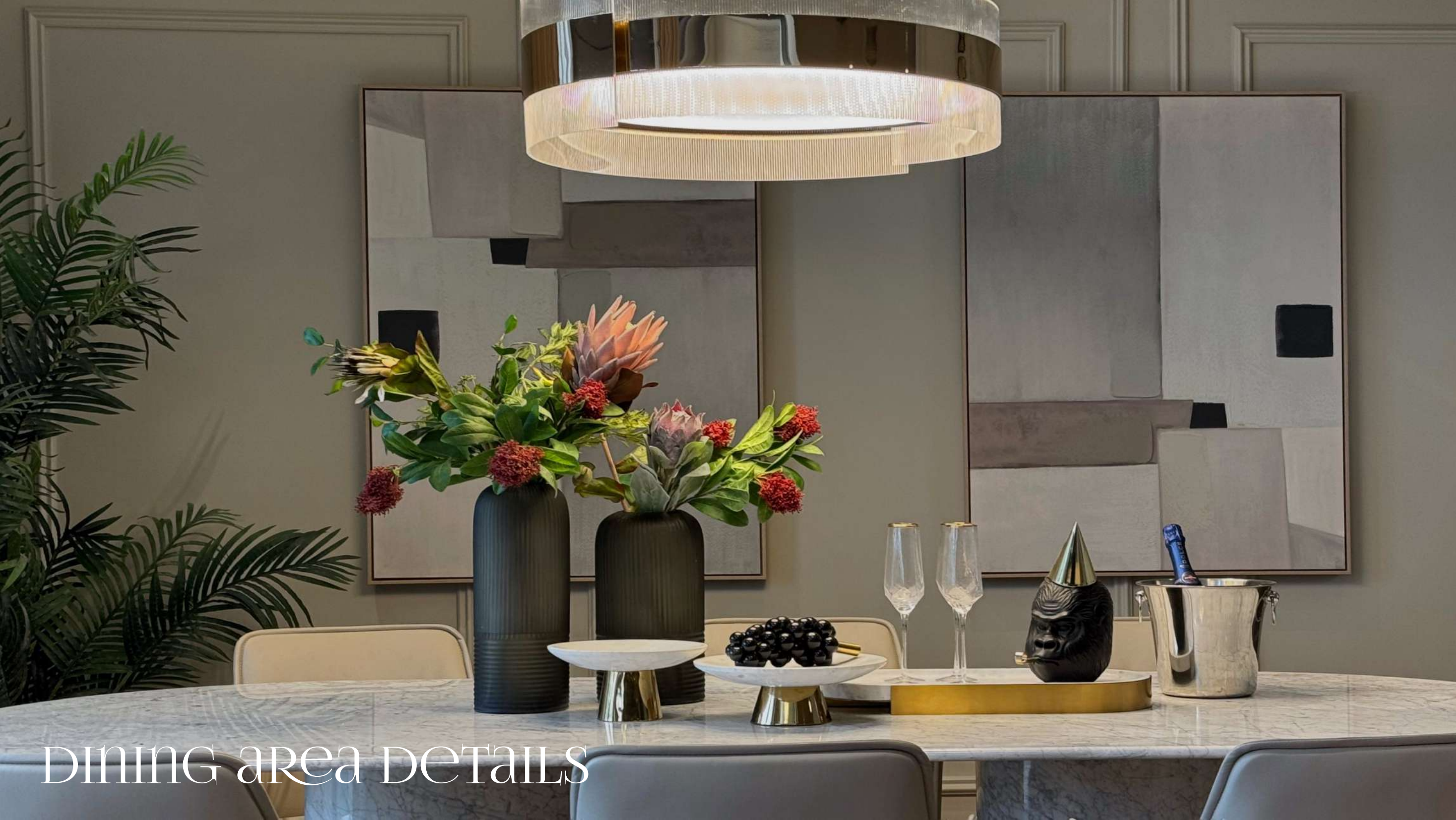
Dining area details