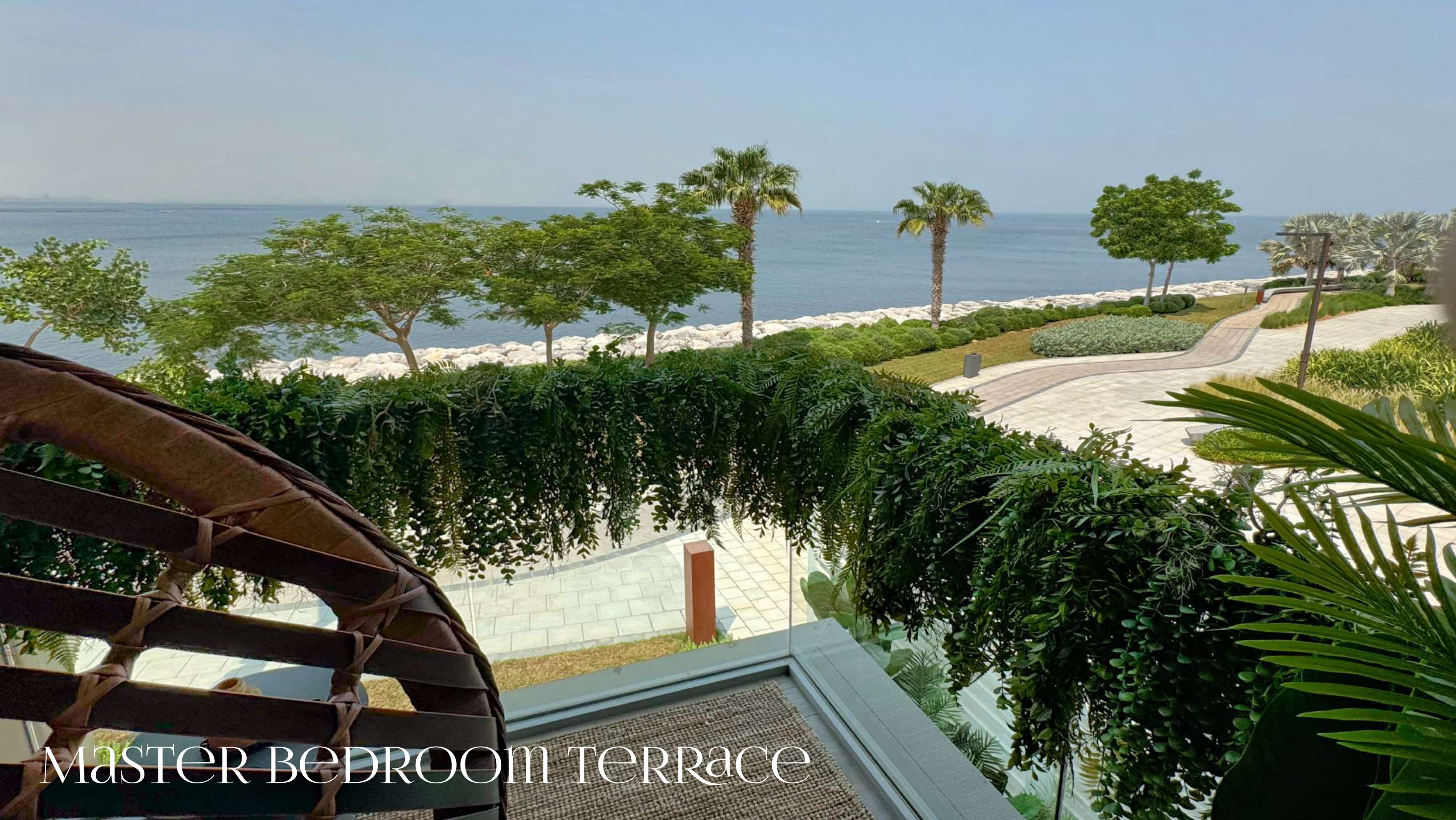
MASTER BEDROOM TERRACE