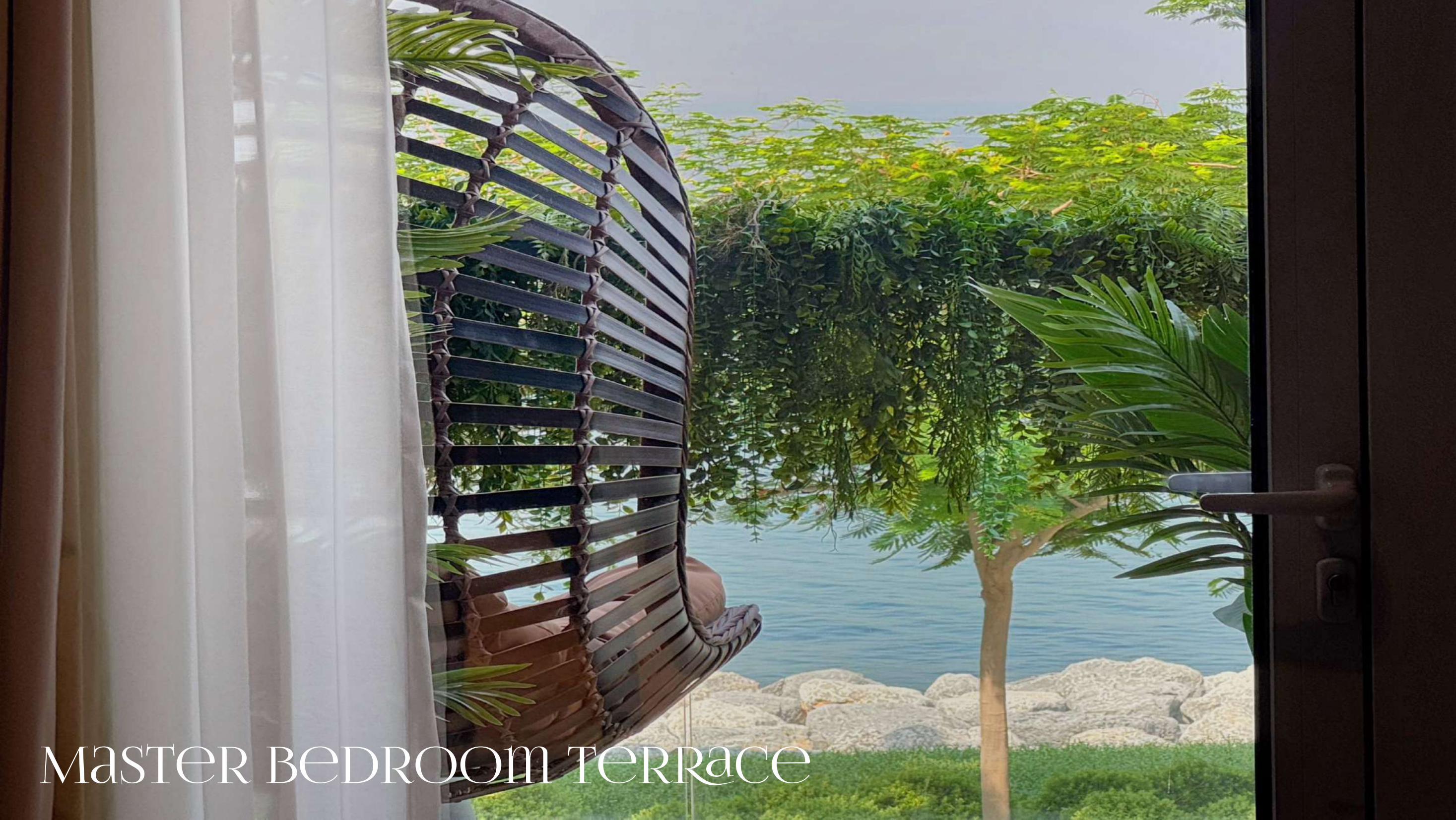
MASTER BEDROOM TERRACE