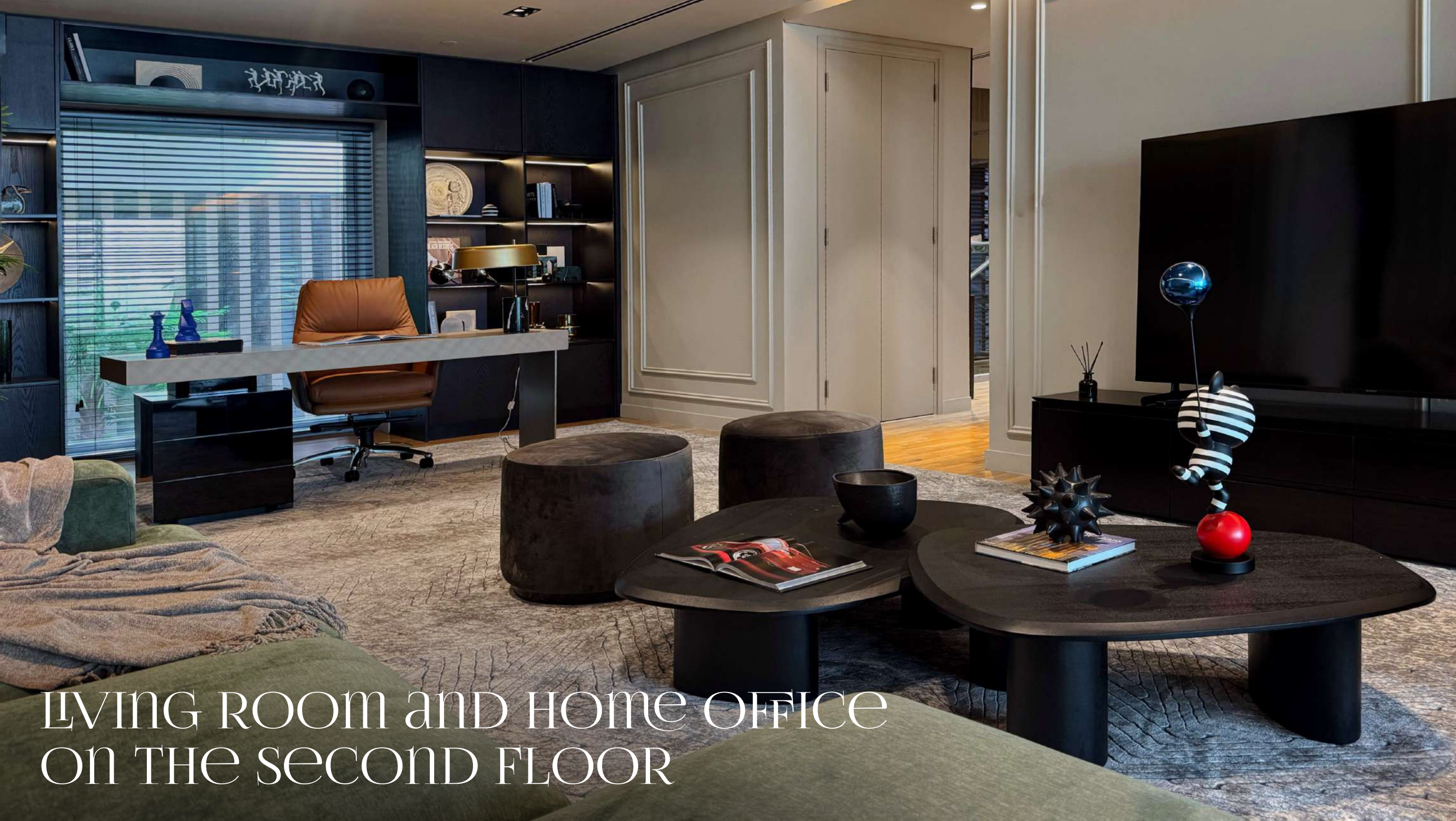
LIVING ROOM AND HOME OFFICE ON THE SECOND FLOOR