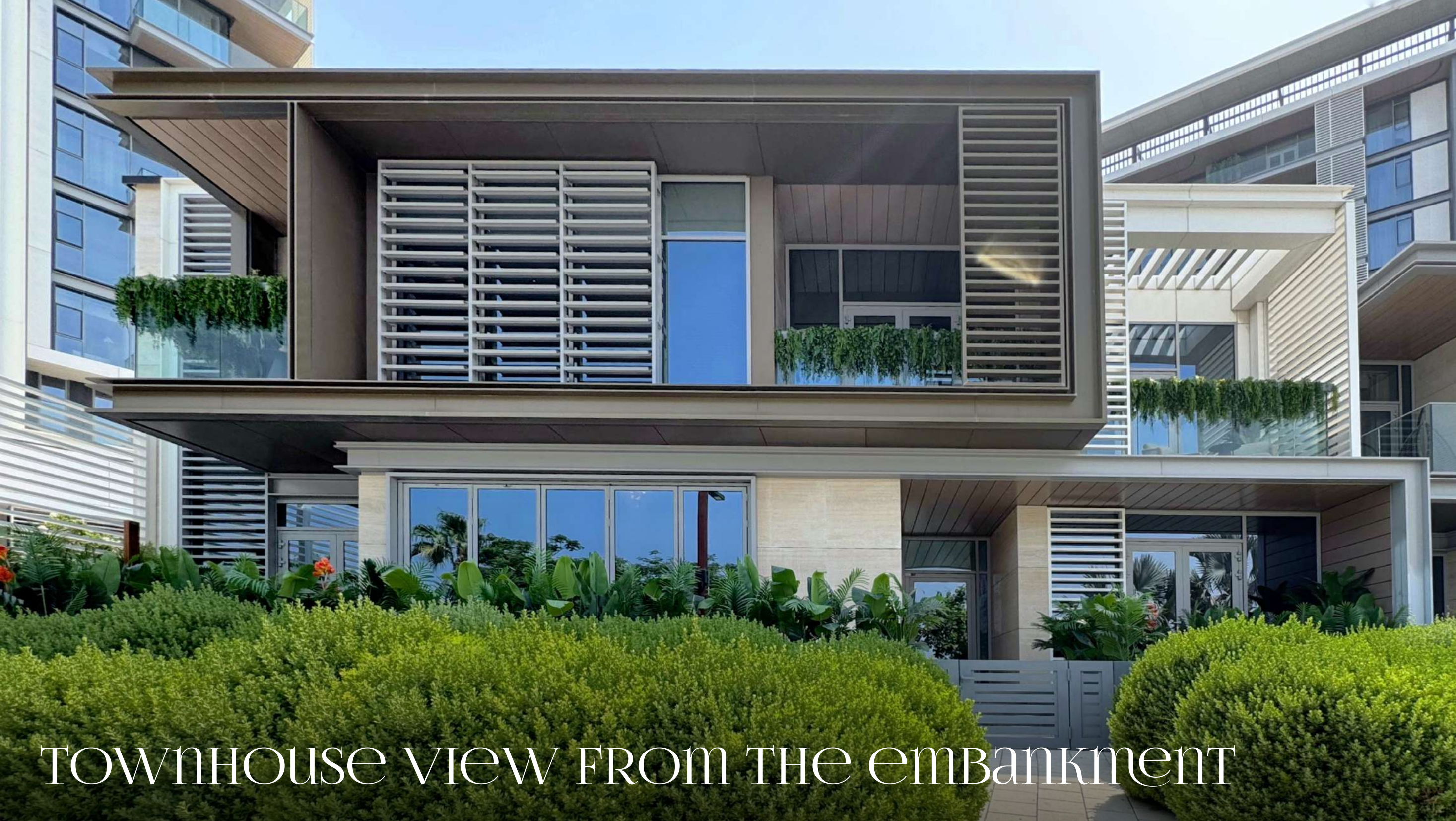
TOWNHOUSE VIEW FROM THE embankment