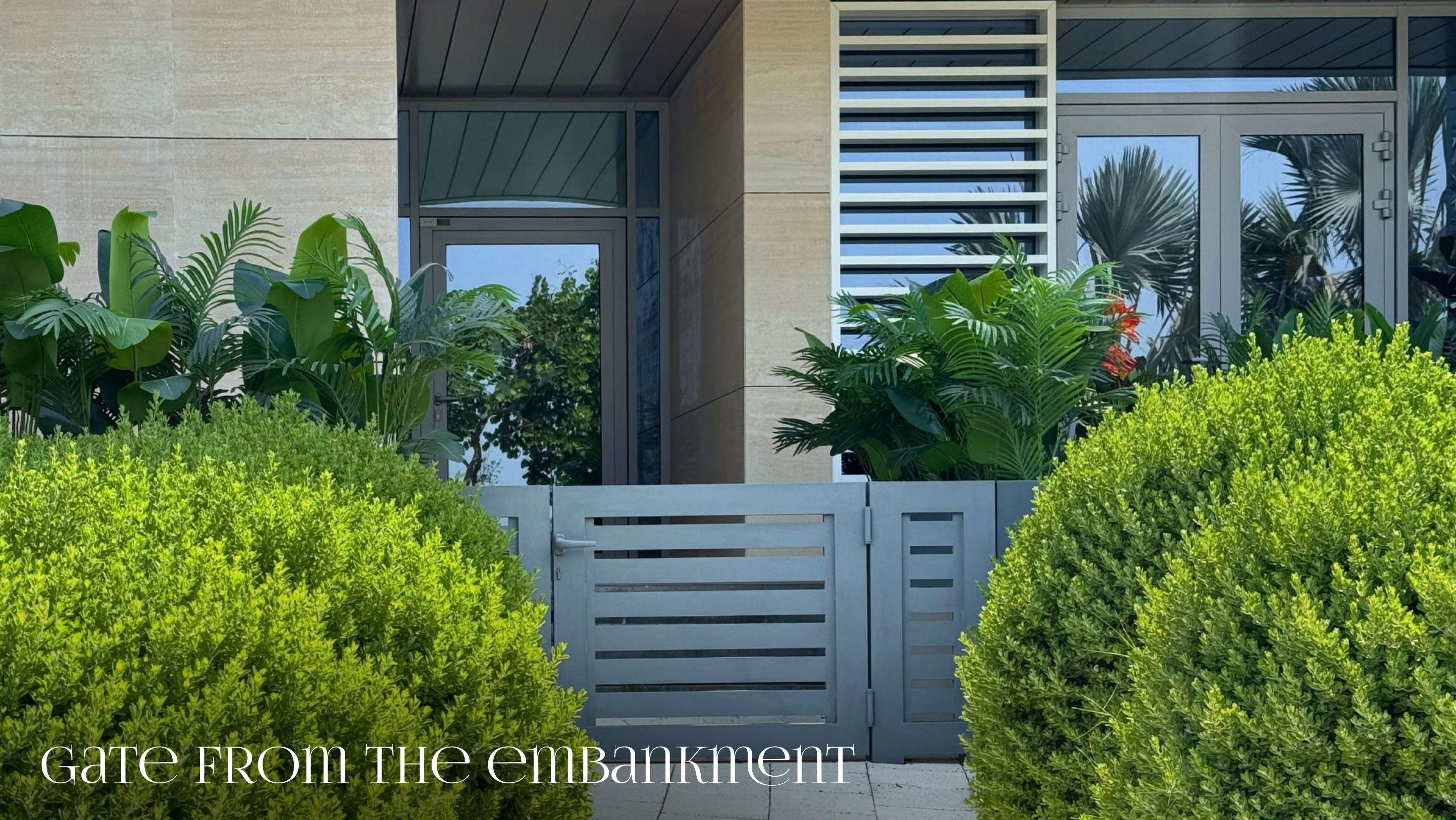
GATE FROM THE embankment