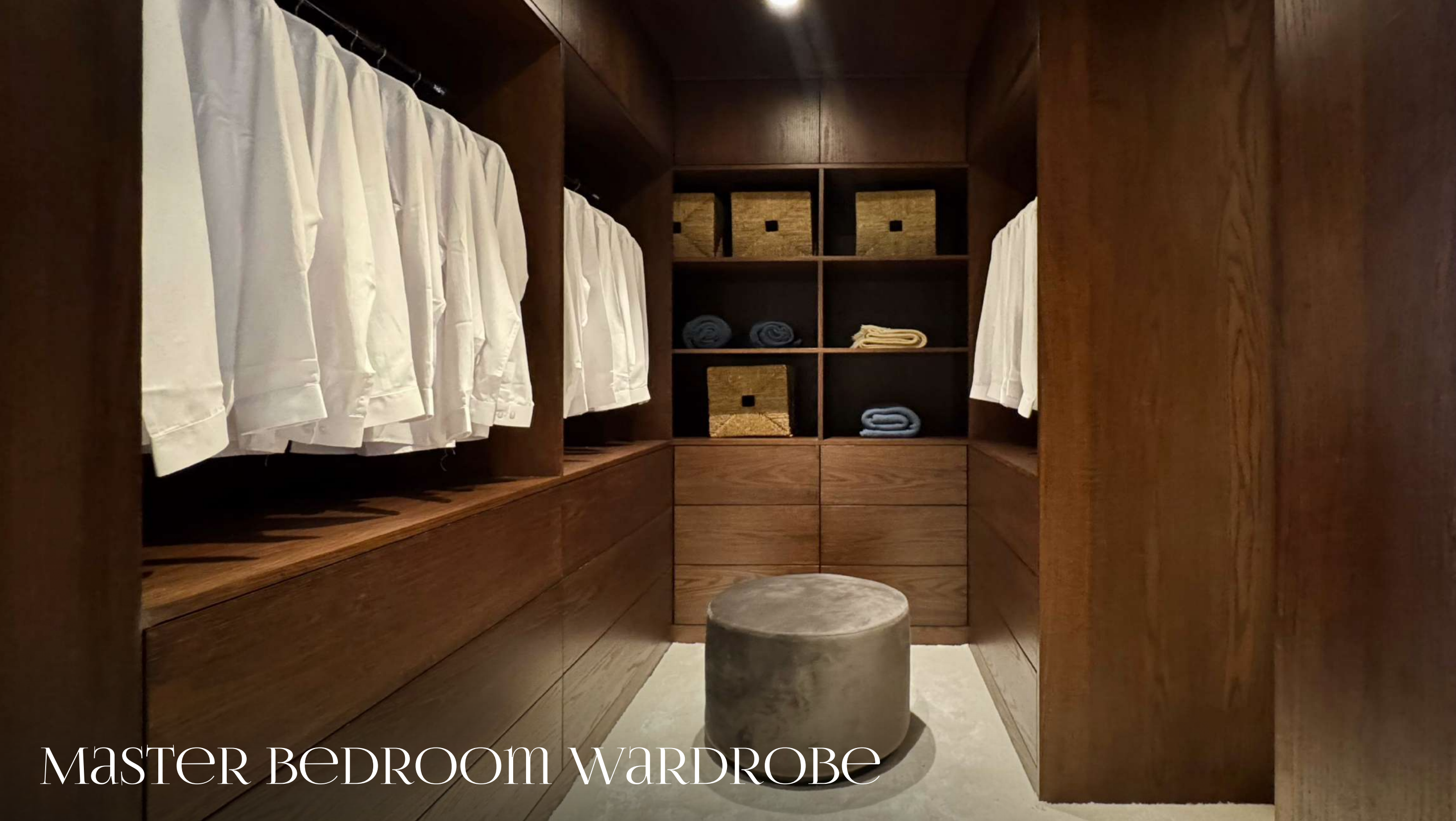
MASTER BEDROOM WARDROBE