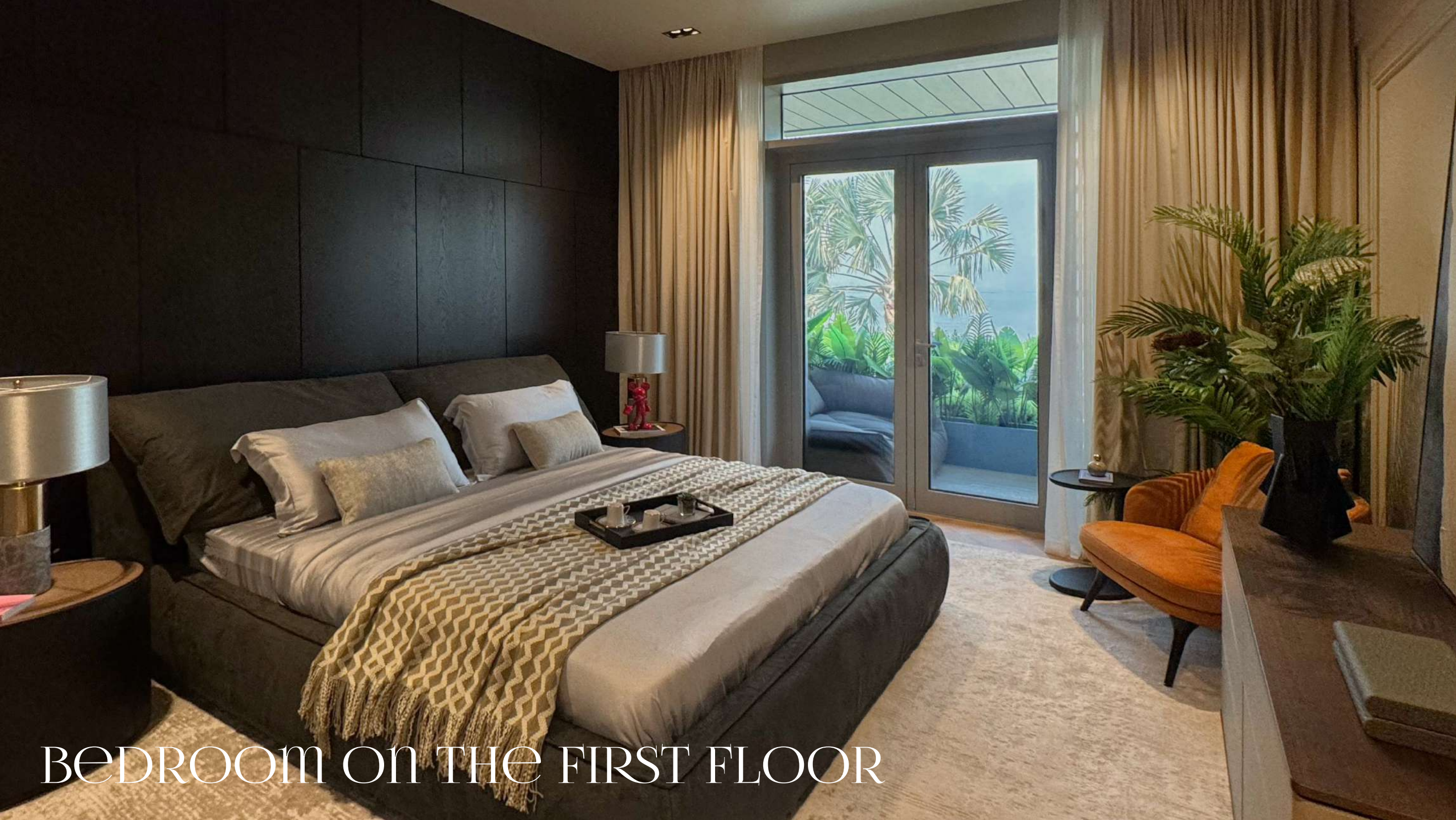
BEDROOM ON THE FIRST FLOOR