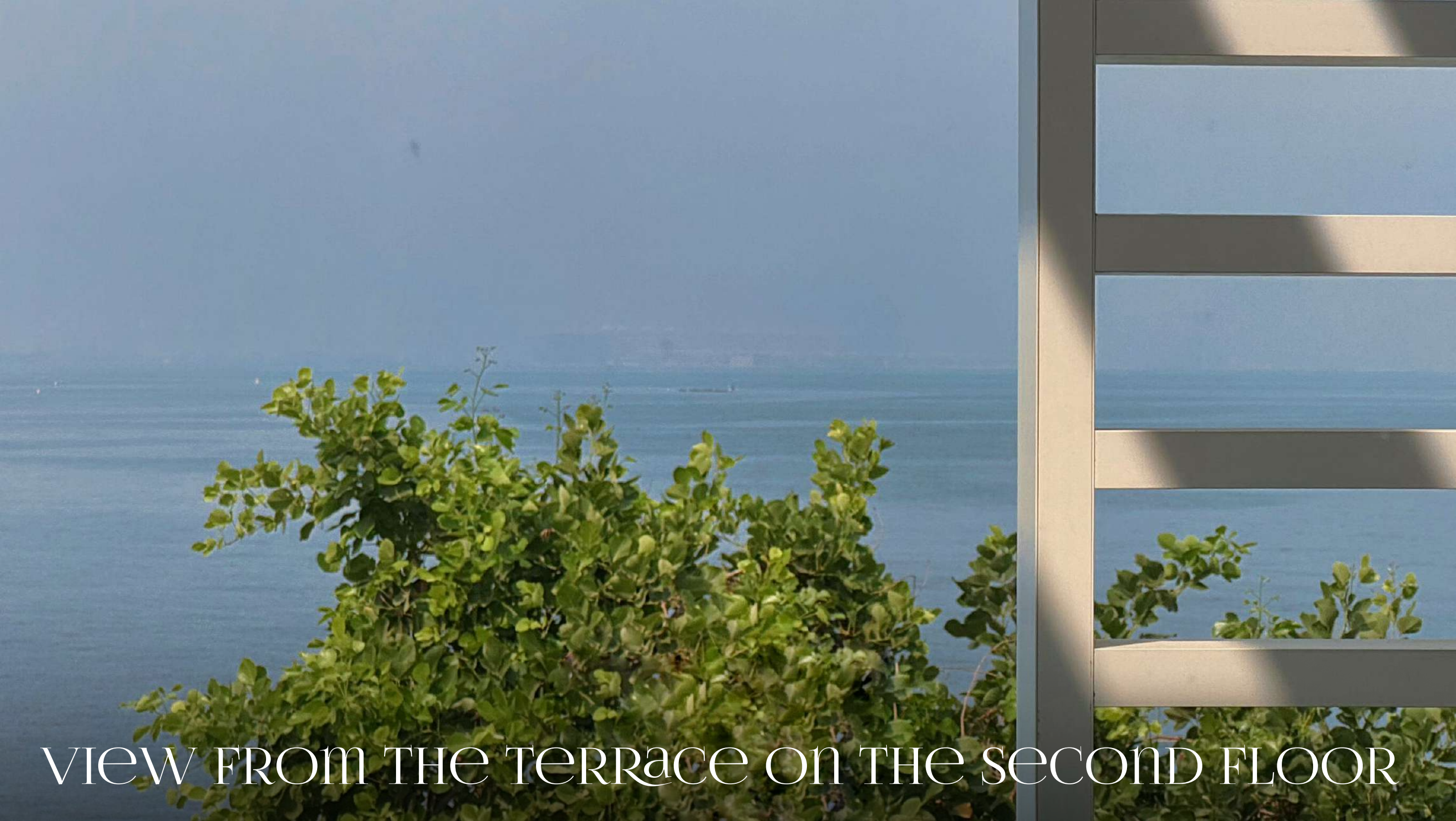
VIEW FROM THE TERRACE ON THE SECOND FLOOR