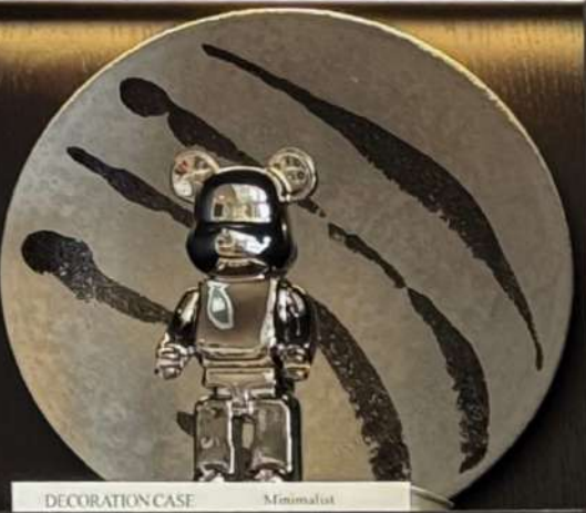
DECORATION CASE Minimalist