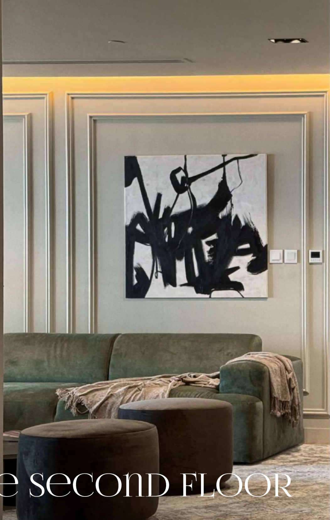
THE SECOND FLOOR