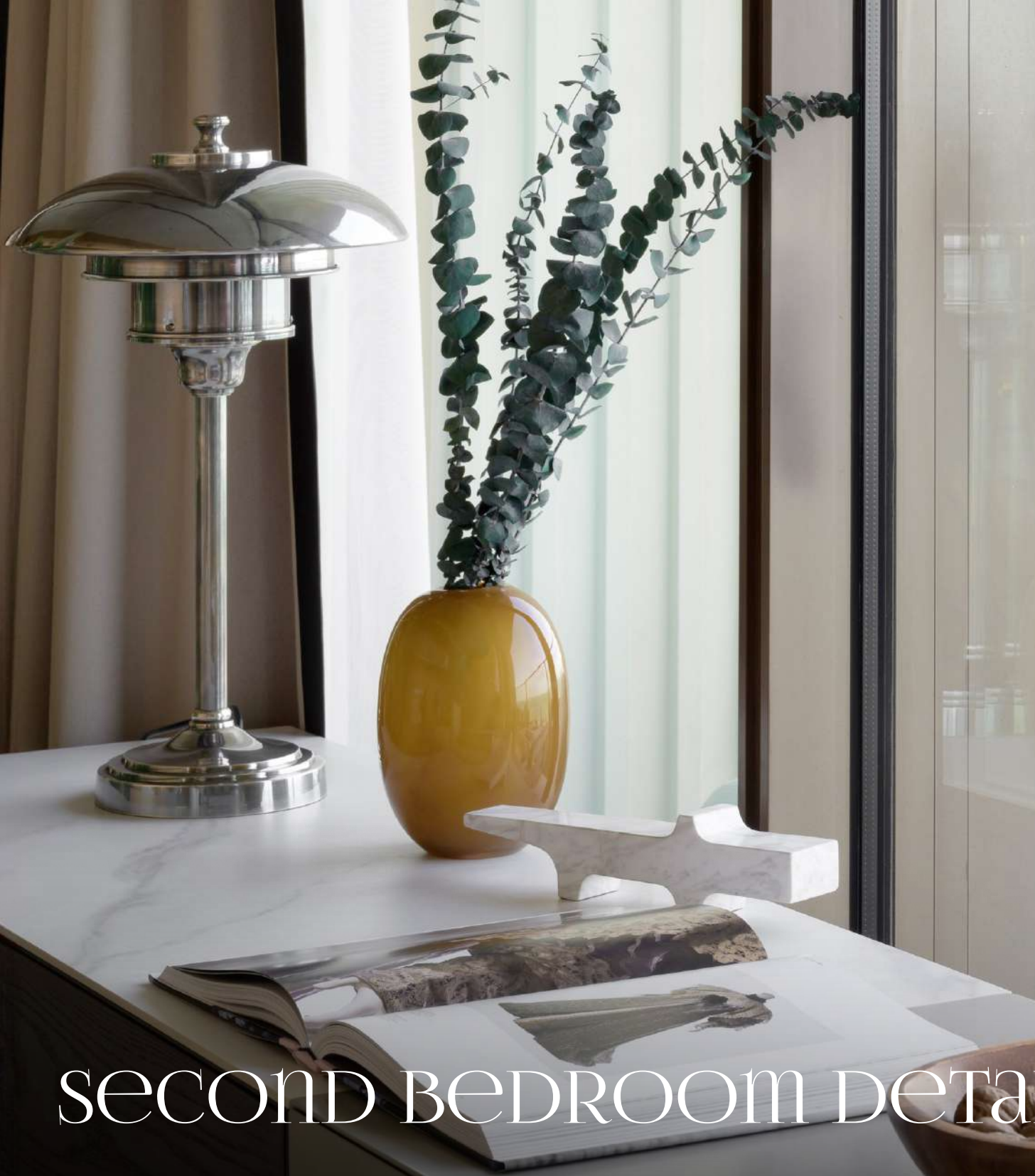
SECOND BEDROOM DETAILS