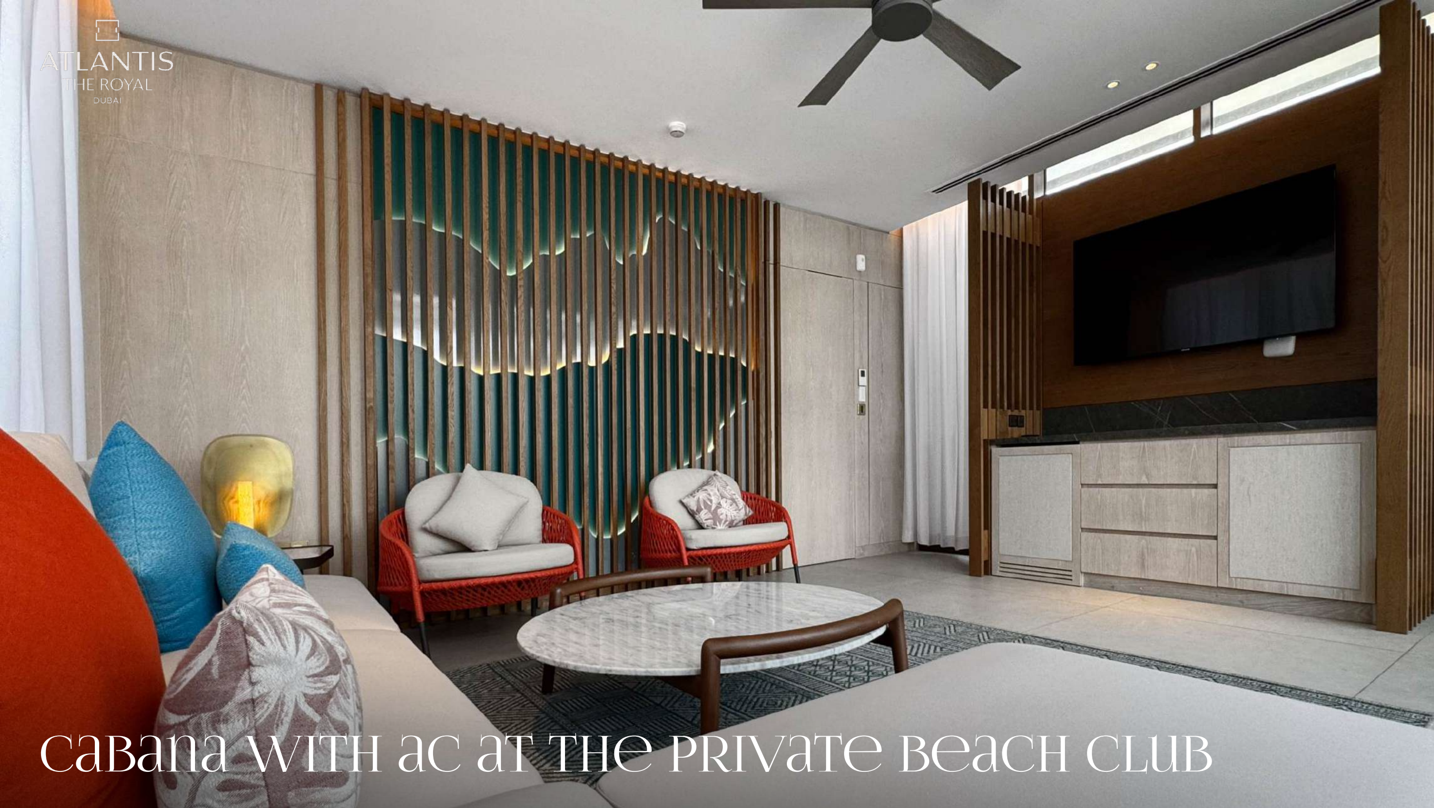
CABANA WITH AC AT THE PRIVATE BEACH CLUB