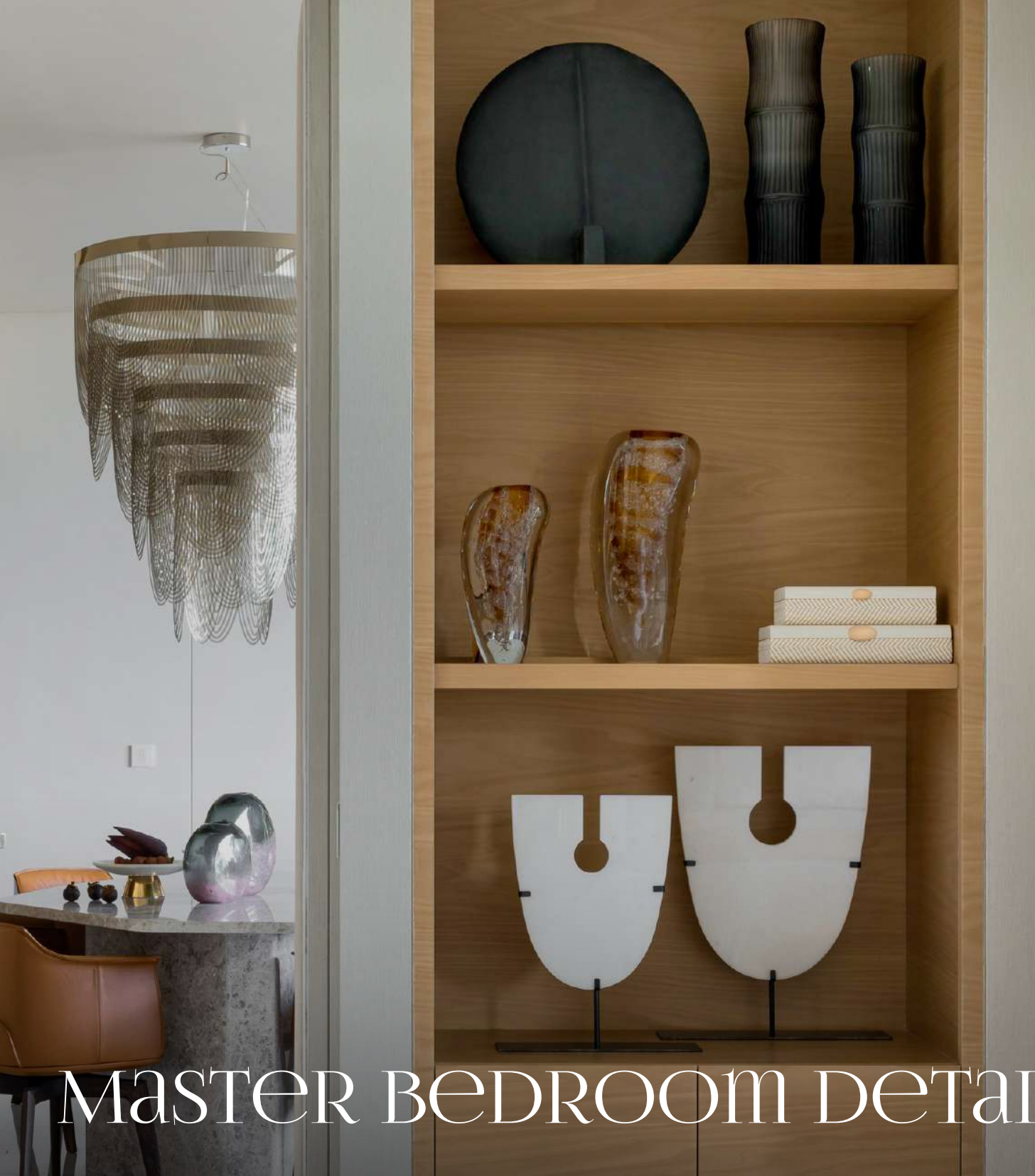
MASTER BEDROOM DETAILS