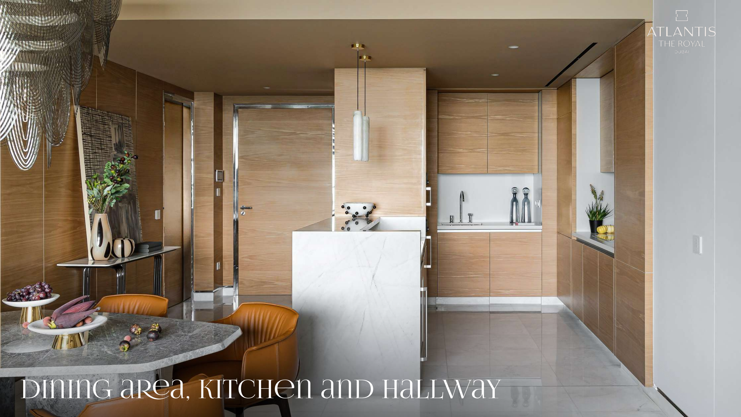
DINING area, KITCHEN and HALLWAY