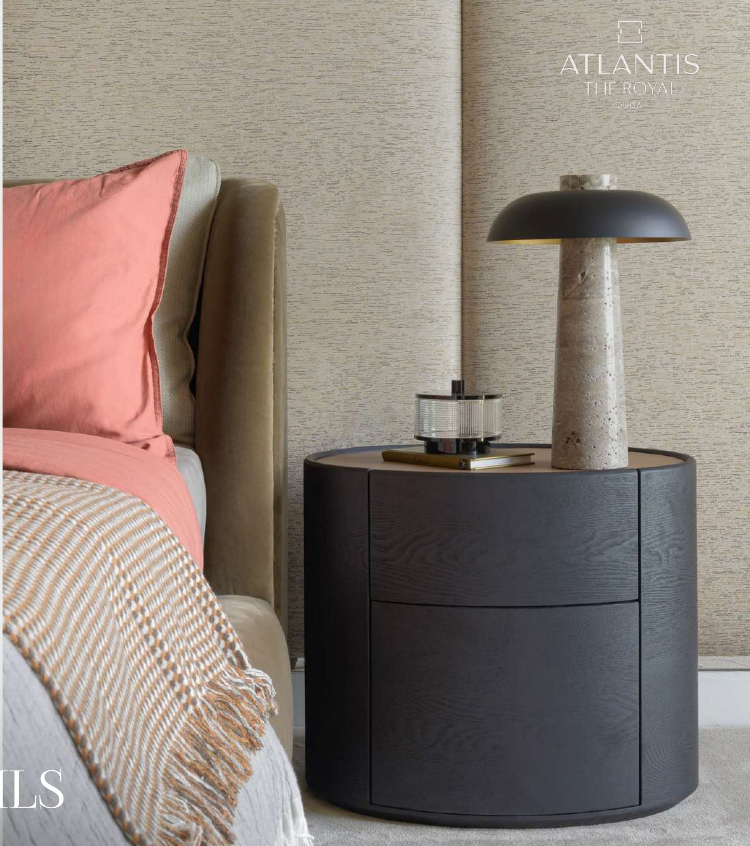
SECOND BEDROOM DETAILS